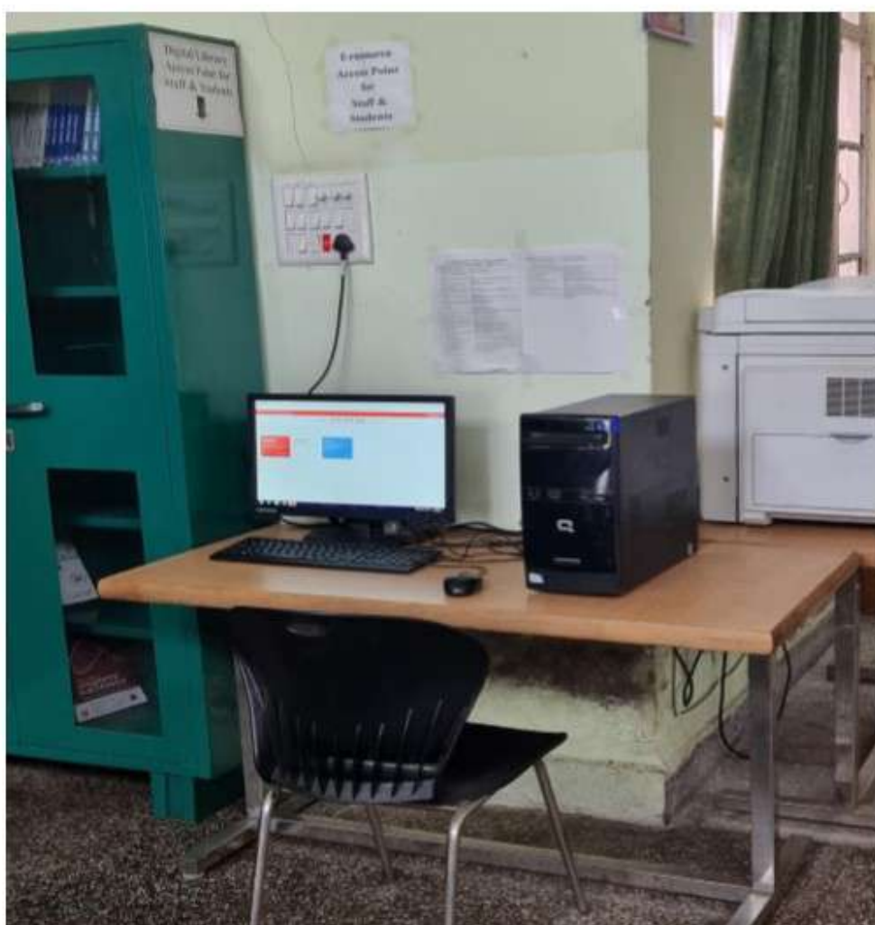
E Resource Access Point