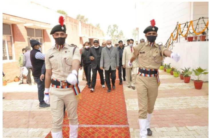
Piloting by cadets for Ex-Chief Minister of Haryana on the 50th Foundation Day of college