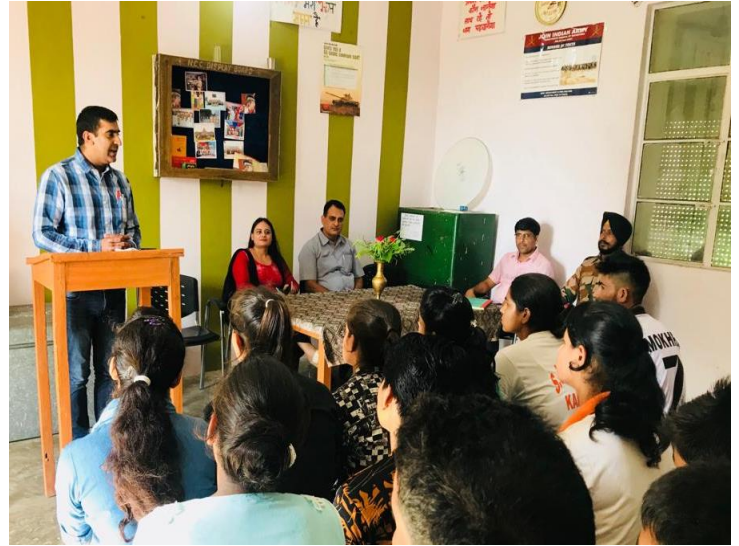
Talk programme organized by NCC Unit on 'Clean India'