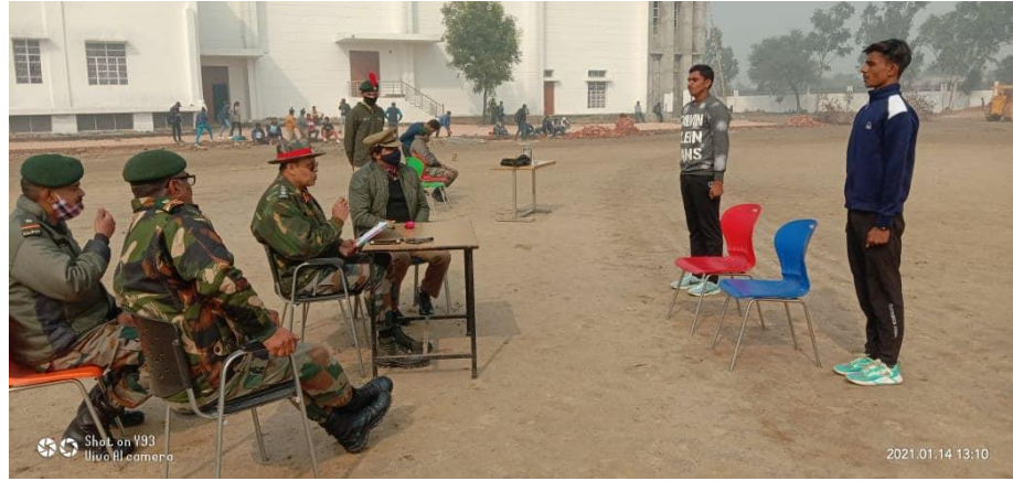
Personal Interview being conducted by Commanding Officer during enrollment process of NCC Unit