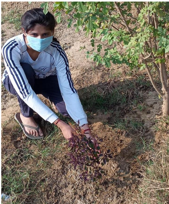
Cadet planting a sapling during tree plantation drive