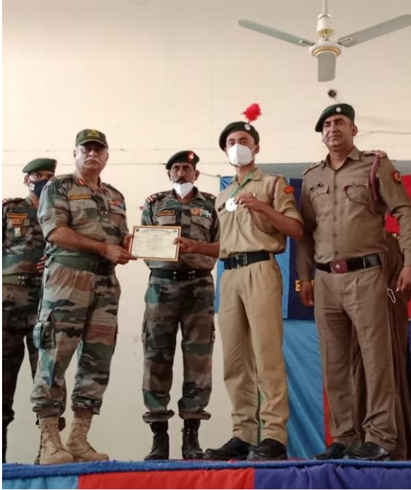
Cadet receiving award at ATC, Nimriwali (Bhiwani)