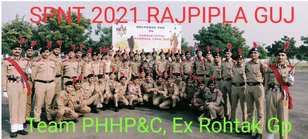
Cadets participating in All India level Trekking camp held at Rajpipla, Gujarat