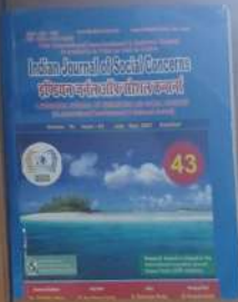
Indian Journal of Social Concerns