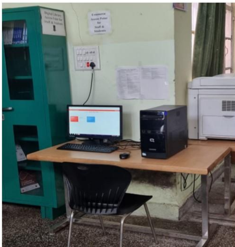
E Resource Access Point