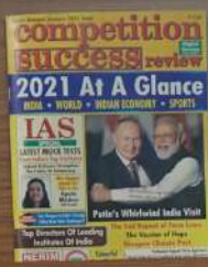
Competition Success Review