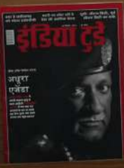
India Today (H)